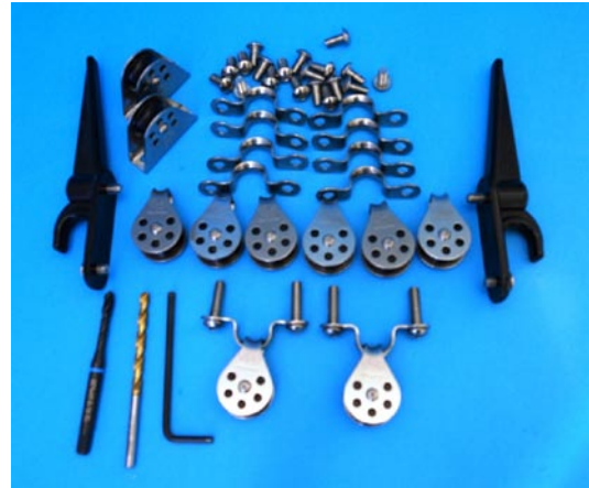
OH Lazy Jack kit - article no. 830004

For mounting you only need a knife, a lighter and a drilling/screw machine.